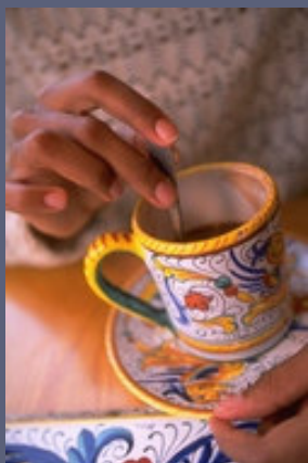
Break of Day— practical break for single parent families.